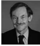
Robert B. Zoellick

Chancellor of the Federal Republic of Germany