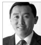
Arthur C. Yap

Minister for Economic Cooperation and Development of the Federal Republic of Germany